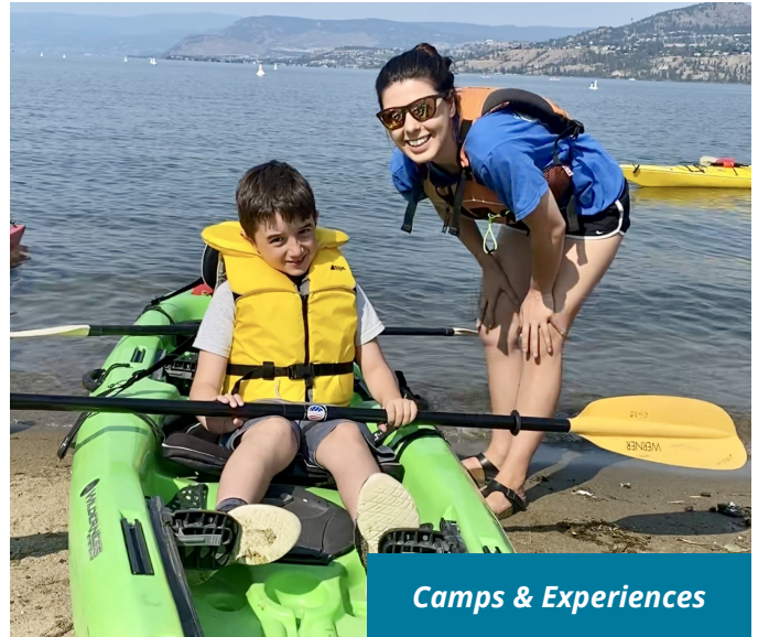
Camps & Experiences